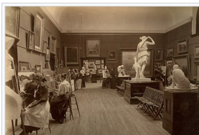
Ladies' College class.